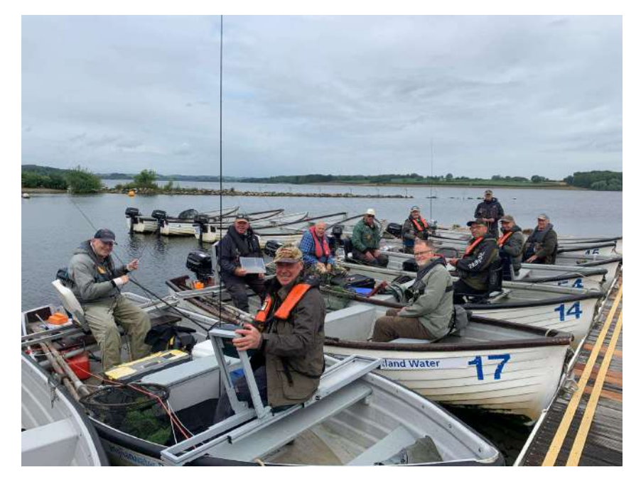
GWFFA social boat day 3<sup>rd</sup> July Rutland Water