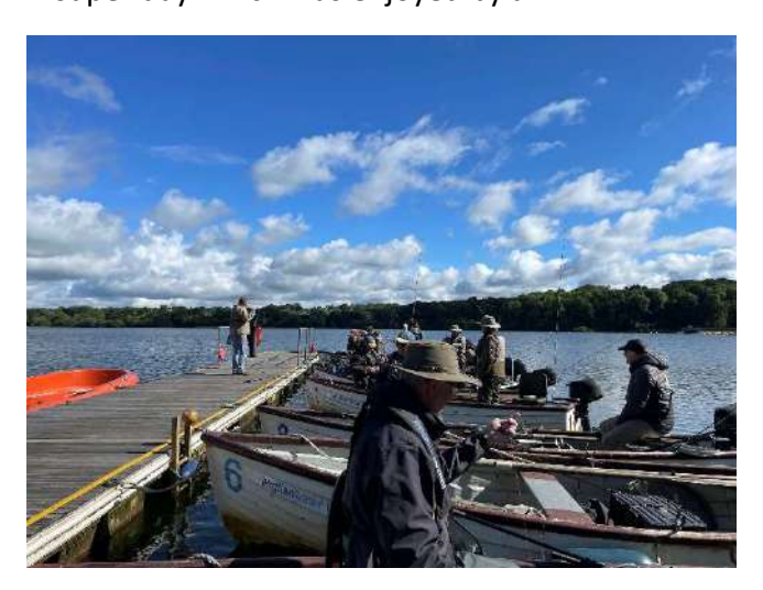
Captains briefing, BBQ & Prize winners