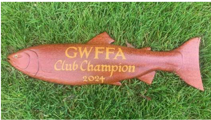
GWFFA 2024 Champions Trophy

These are all booked via Clubmate unless you wish to pay cash in which case let me know and I will book for you. A reminder to the 2023 and 24 new members that you can book any social event and take advantage of the £5.00 offer for one event. Please contact me and I will book you in and you pay me cash on the day. Also remember for social days you are welcome to invite a guest and fish with them, again let me know and pay cash (£15) on the day.