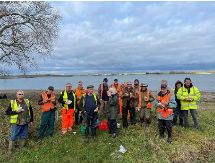
Plummer Park break time for bacon sandwiches