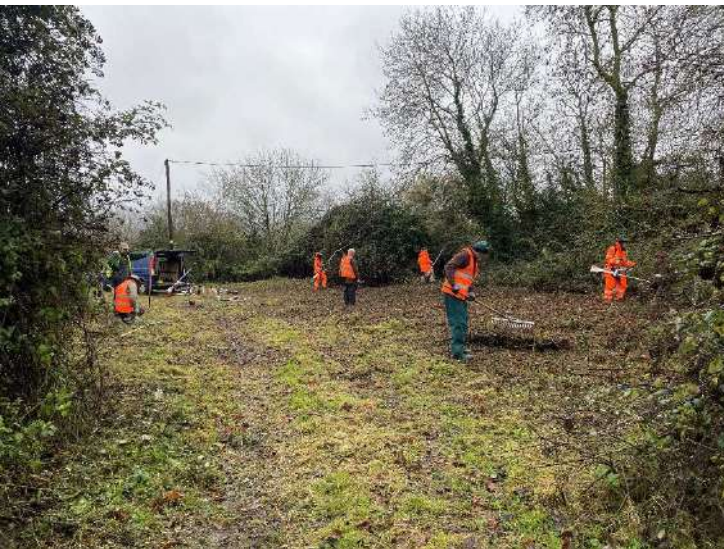
Clearing the new car park for the Seat