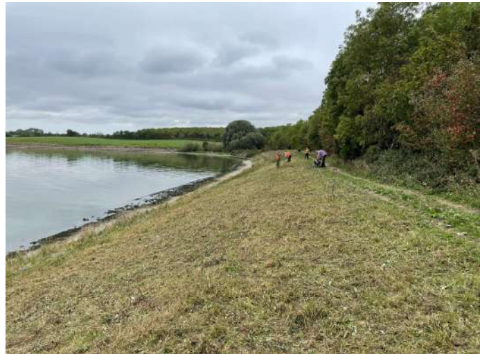
Pylon Point nearly finished