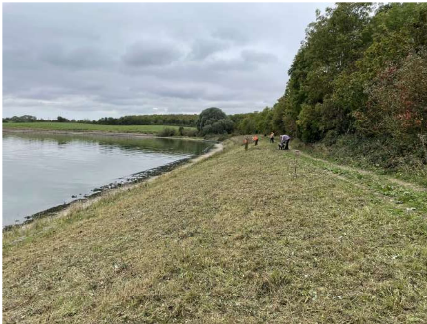
Pylon Point cleared.

Mon 5th Feb, Mon 19th Feb, Mon 26th Feb.