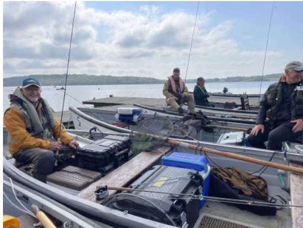
Ready for the off