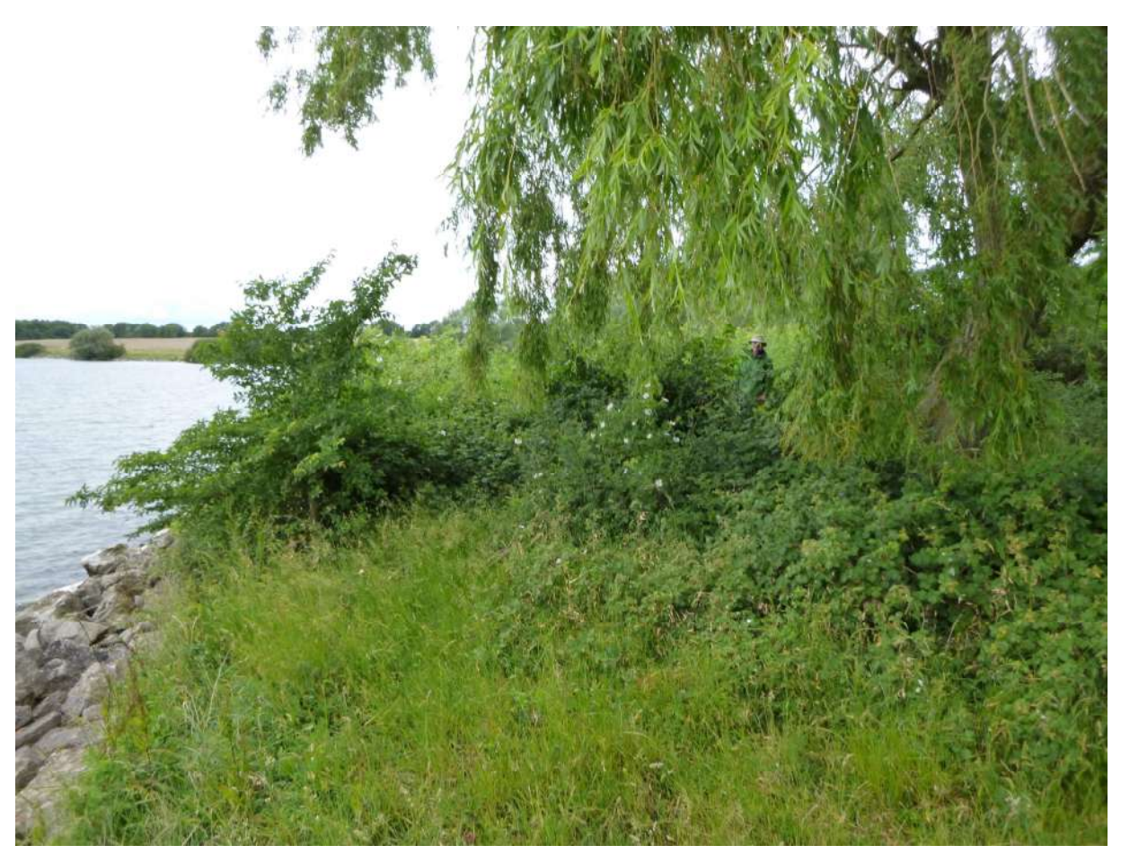
GWFFA Bank Clearance Sessions 2023

please let me know if you can fish via email <a href="mailto:captain@gwffa.co.uk">captain@gwffa.co.uk</a> or via text 07921 940836.