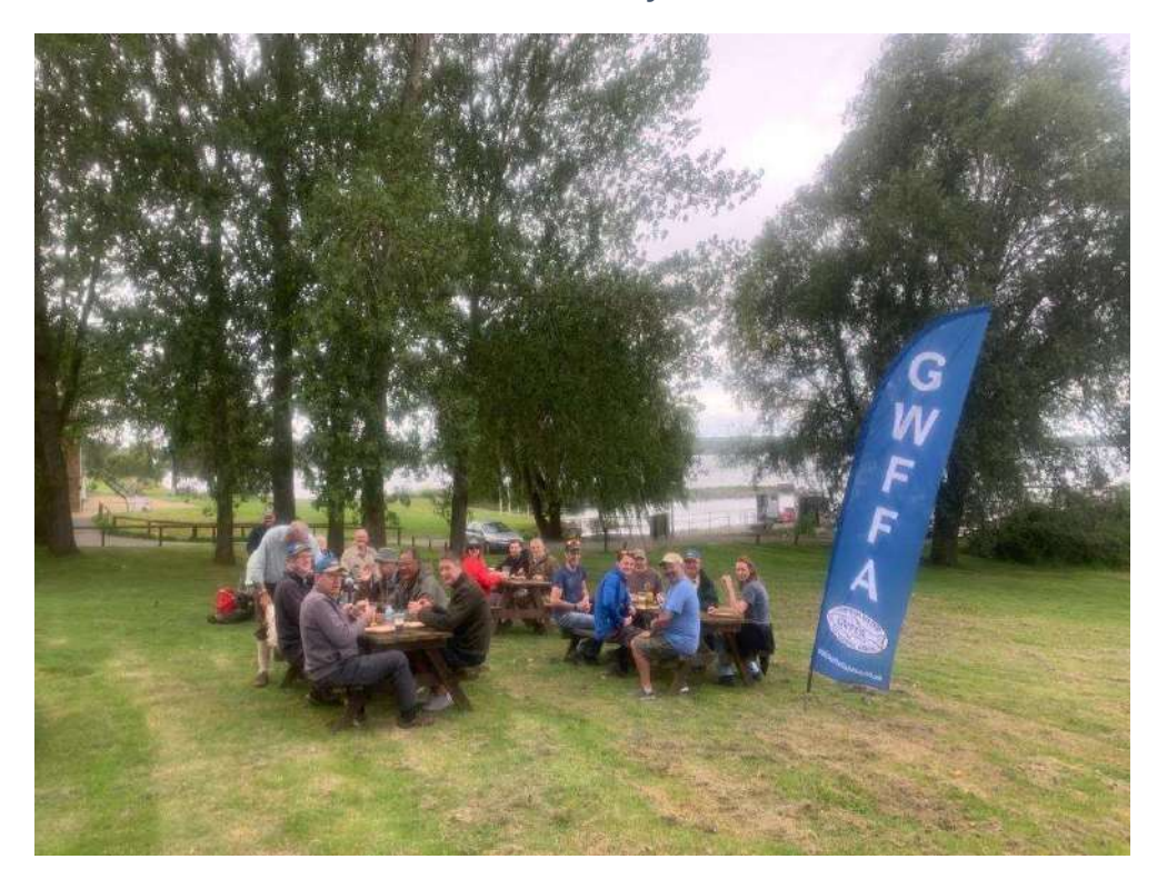
Members enjoying the BBQ. Thankfully the rain held off until we finished.