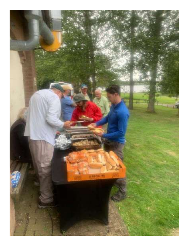
BBQ held behind the Grafham boat shed.