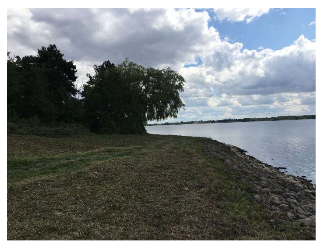
Harts Bluff bank after clearance