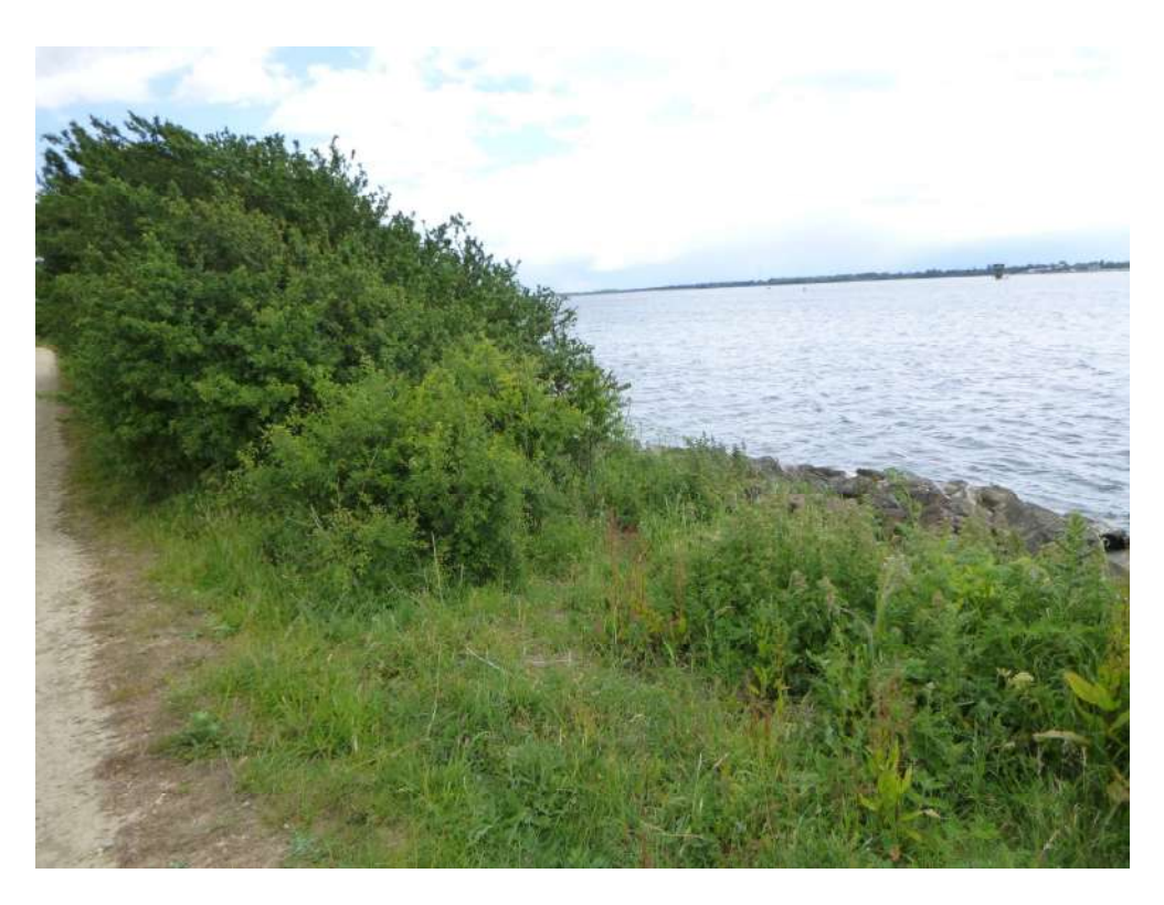
Harts Bluff bank before clearance