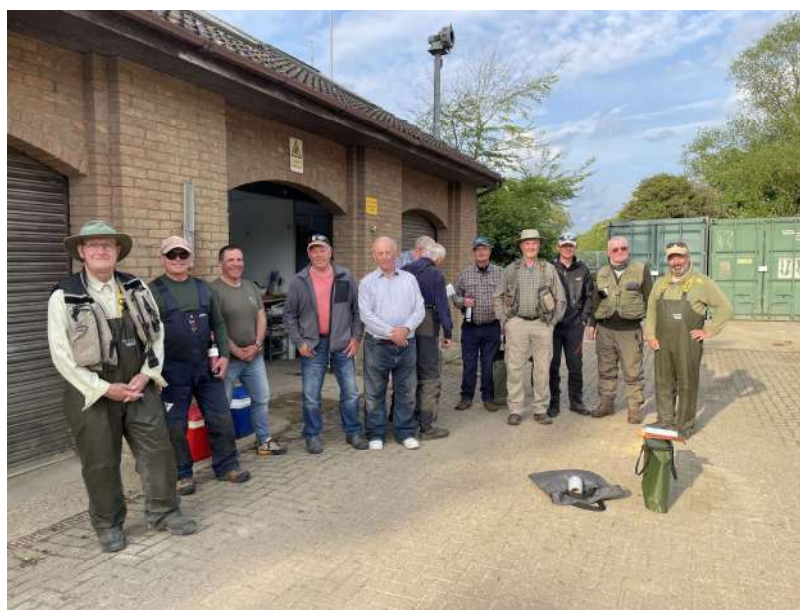
2 - Weigh - in 1st Bank Match