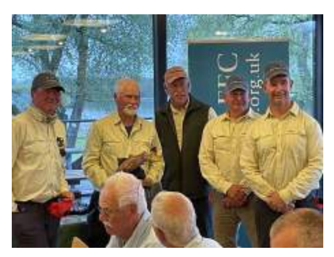
Winning team Snowbee Guests.