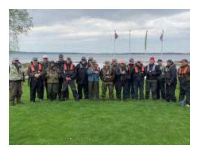
Snowbee Practice Day

What helps lead to a successful result is time spent on the water practicing. There was no shortage of support for the day!